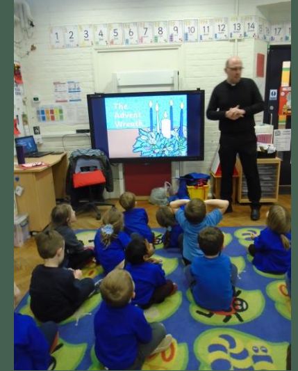
Links with the local church