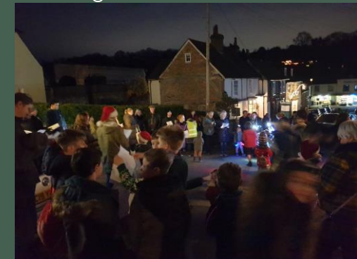
Carol singing around the village with the Church choir