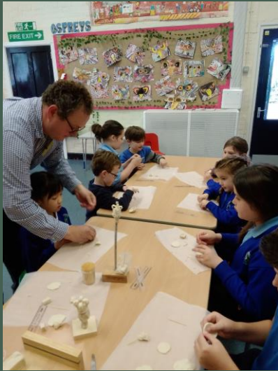
Workshop from a local artist