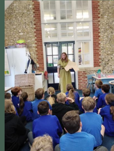
Visitors from a local historian/story-teller to share the history of our local area