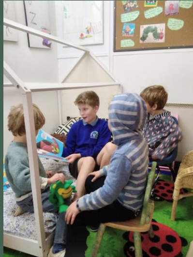
Working with the Hambledon Greening Society