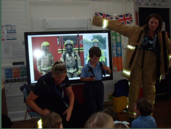
Workshops from the Fire and Police services